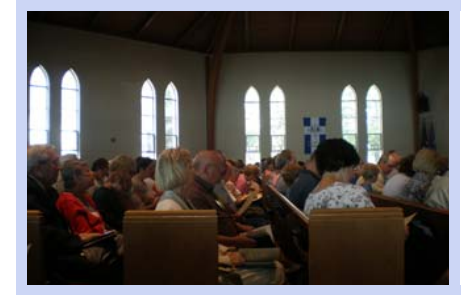
Orchard Lake Community Church, Presbyterian